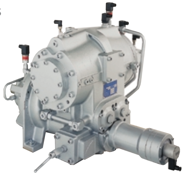
SAB 128 screw compressor block